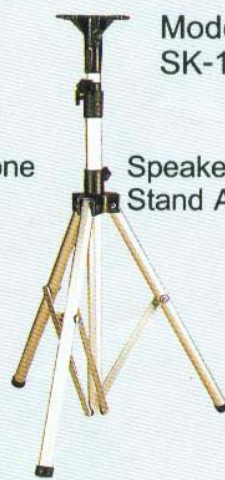
Speaker Stand Aluminium