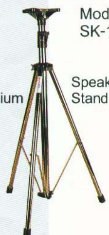
Speaker Stand Steel

Note: NPE Audio reserves the right to alter design features and specifications without prior notice as part of its on going development program.