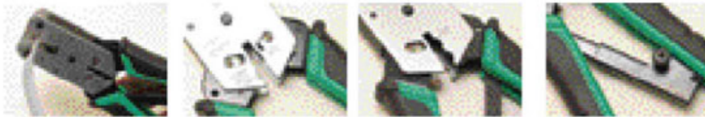
Crimper Round cable stripper Cutter Ratchet Release