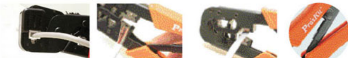
Crimping Stripping Cutting 808-376I W/Ratchet