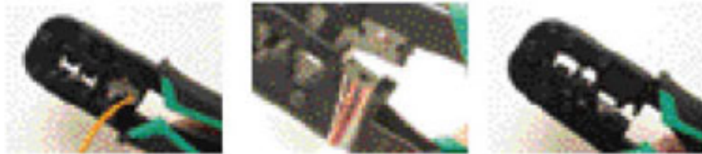
Strips twisted pair wire Strip flat telephone wire Cutter