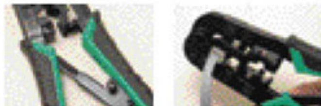
Ratchet system 4/6/8P Crimper