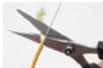
For cutting Kevlar of fiber optic cable