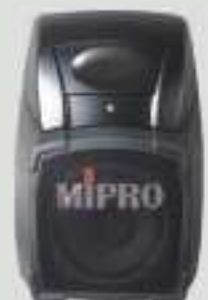
MA-101AXP Extension Speaker