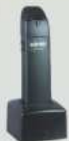
MP-101ACT Microphone Charger